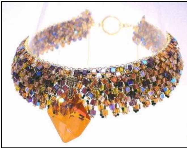
“Canyon Sunrise”, Warren Feld, designer, 2004, Austrian crystal, glass seed beads, 14KT gold chain and constructed clasp, fireline cable thread, photographer Warren Feld