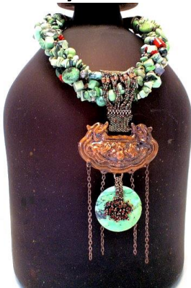
“Tibetan Dreams”, FELD, 2010

Jewelry is a two-way street. It is a way to create, confirm and retain connections. At its very core, it is interactive and communicative. It is more an action than an object . Jewelry can start a conversation. Jewelry encapsulates a very public, ongoing matrix of choices and interactions among artist, wearer and viewer, with the purpose of getting responses. It is a dialectic.