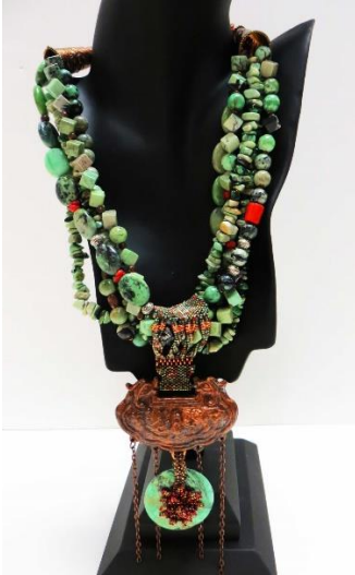
"Tibetan Dreams", Feld, 2010