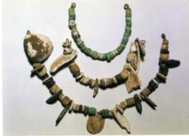
Prehistoric Necklaces 40000 B.C

that have some perceived value. It can be used to adorn nearly every part of the body.