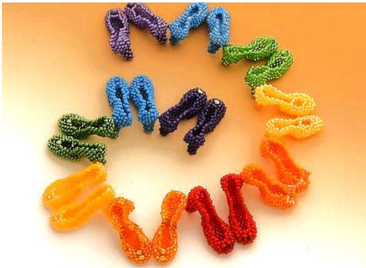
E. Up And Over Stitched in tubular (or cubelar) right angle weave. 1-day, beginner/intermediate