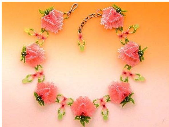
G. Art Novae Sweet Pea