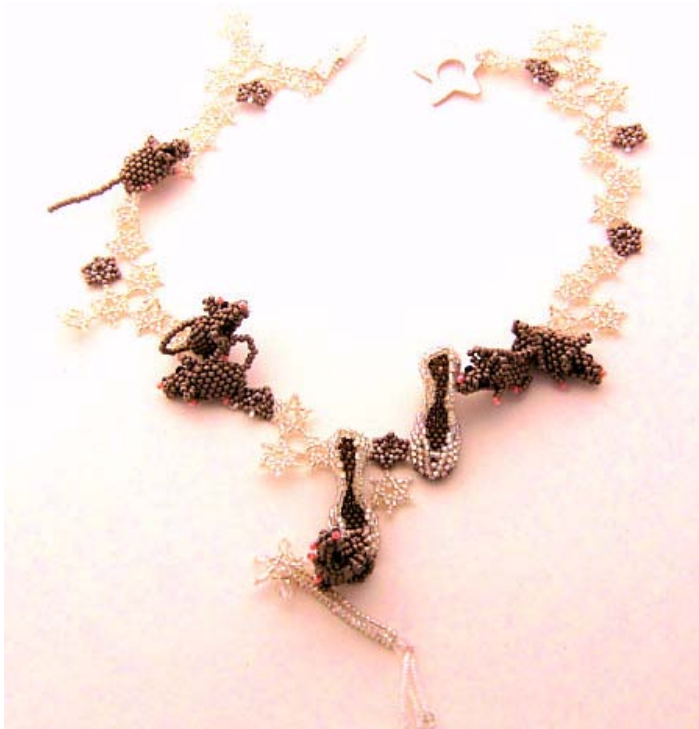
D. A Pair For Every Occasion 1-day, beginner/intermediate