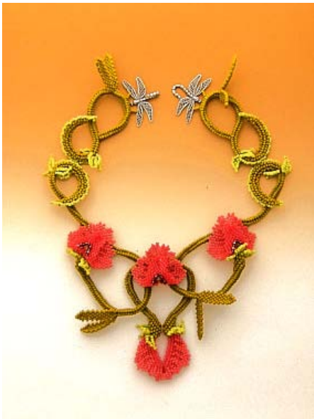
H. Water Lily 2-day, intermediate