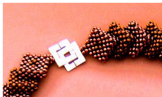
F. Lacy Sweet Pea