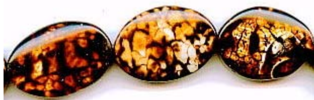
Purple Impression Jasper