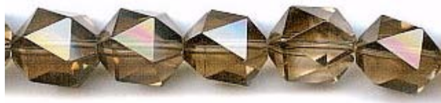
Rock Quartz Crystal

their quest for the prize! Help determine who will go home with a $992.93 shopping spree at Land of Odds