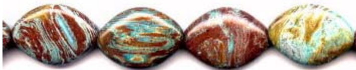
Chinese Chrysocolla, from $8.10/strand