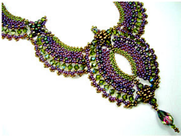
Huib Petersen - May 20-22, 2011 Workshop Topics to be announced