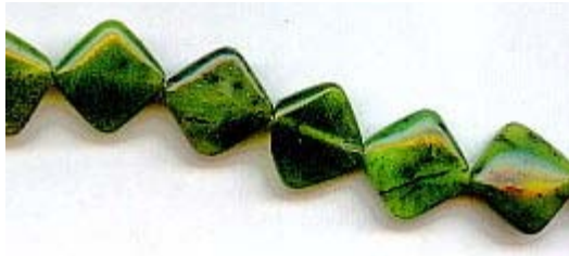
Rubylite, from $3.30/strand