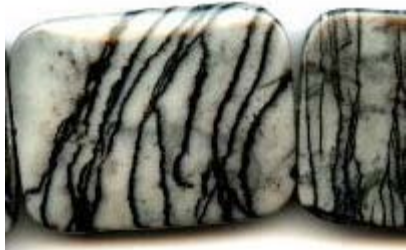
Canadian Jade, from $9.25/strand