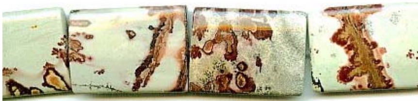
Black Water Jasper, from $4.95/strand