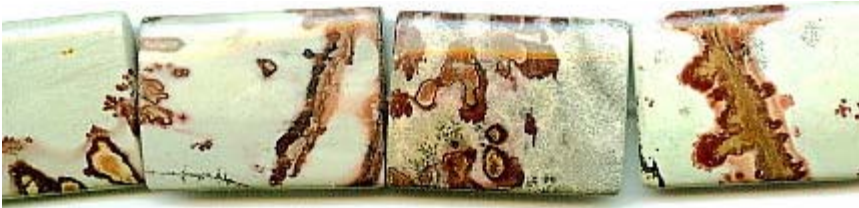
Black Water Jasper, from $4.95/strand