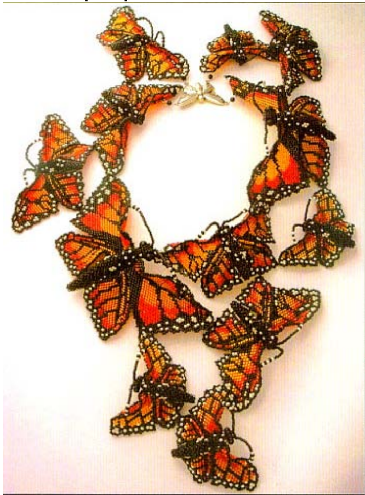
Sherry Serafini – August 26-28, 2011 Workshop Topics to be announced