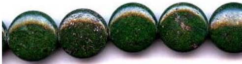
OLIVE FIRE AGATE