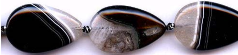
RAINBOW SNAKE SKIN AGATE