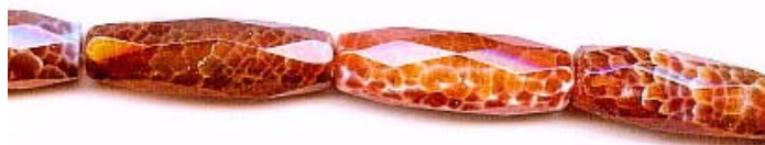
Rhyolite, from $16.90/strand