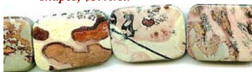
Red Bend Jasper, from $13.90/strand