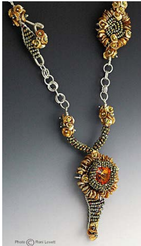
Sat, April 17, 2010 DRAGON'S EYE PENDANT AND NECKLACE