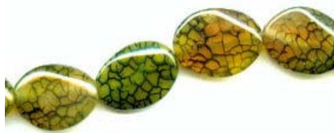
Orange calcite, from $3.85/strand