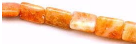
Oregon Blue Opal, from $10.90/strand