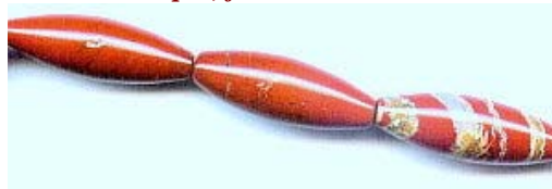
Red Fire Agate, from $18.90/strand