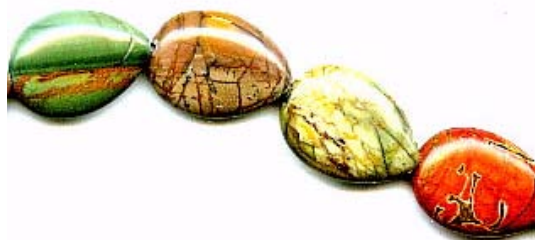
Red Artistic Jasper - rounds, $1.65/str - shapes, $3.40/str