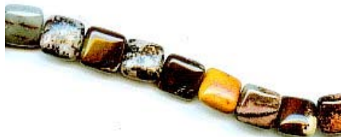
Rainbow Picasso Jasper, from $15.90/strand